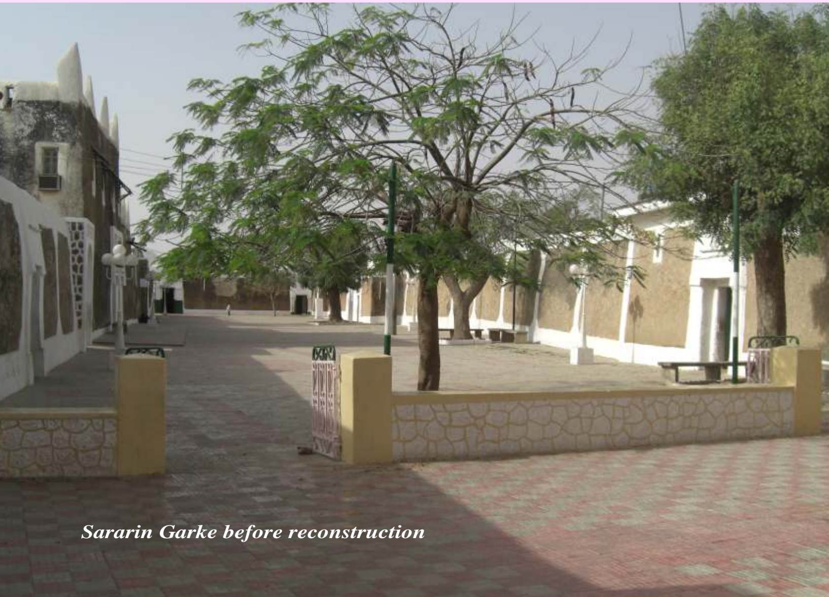
Sararin Garke before reconstruction